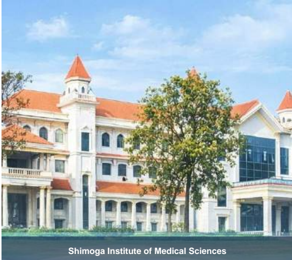
Shimoga Institute of Medical Sciences

Orientation Program for Dermatology Residents